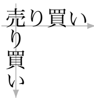
FIGURE 1. Horizontal and vertical typesetting. Note that some OpenType fonts, such as Hiragino used here, have different glyphs for each direction. Shuzaburo Saito’s otf package can access these extra glyphs of OpenType fonts.

pL A T E X 2 \epsilon document classes, jarticle.cls and jbook.cls , which were in turn derived from L A T E X 2 \epsilon article.cls and book.cls . The name js purports to stand for “Japanese Standard.”