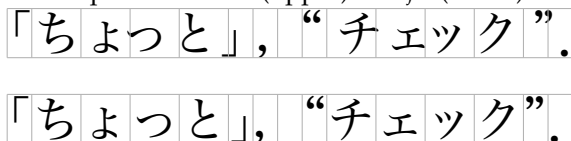
FIGURE 8. Comparison of old (upper) and jis (lower) font metrics.

\xkanjiskip can also be controlled by another primitive, \xspcode , that applies to Latin characters. In this case, 0 inhibits insertion of \xkanjiskip on both sides, 1 allows insertion on the left, 2 on the right, 3 on both sides. For example,