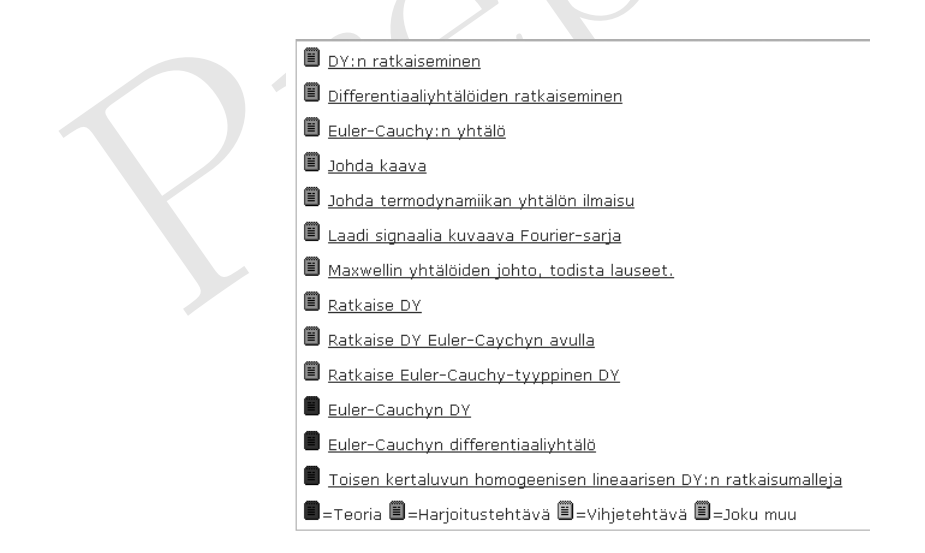
Figure 4: Outcome of the search with the word Euler

Figure 3: A view of the search with the word Euler