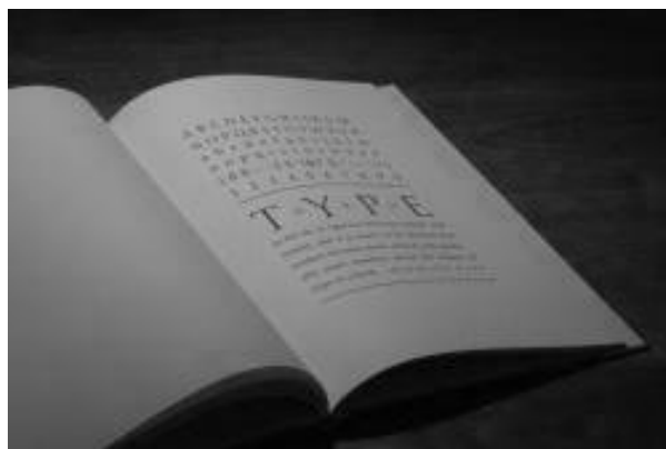
Figure 4: 2016 main prize: Manuale Zapficum .