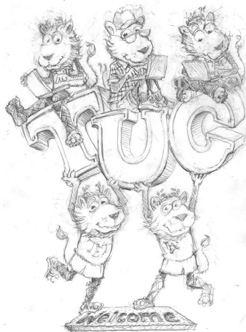
Figure 3: 2015 main prize: Duane Bibby's drawing.