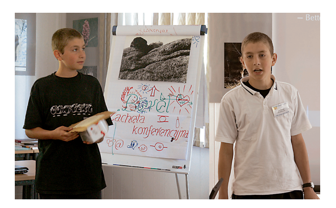
Figure 3: Left: with the diploma; right: self-confident